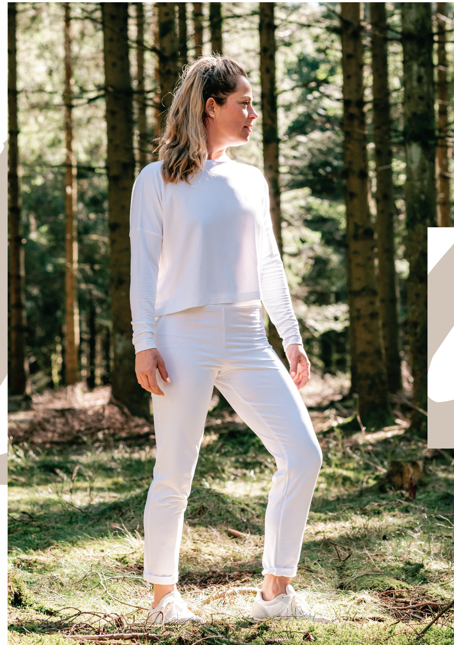
COD. 1675 TSHIRT BAGGY