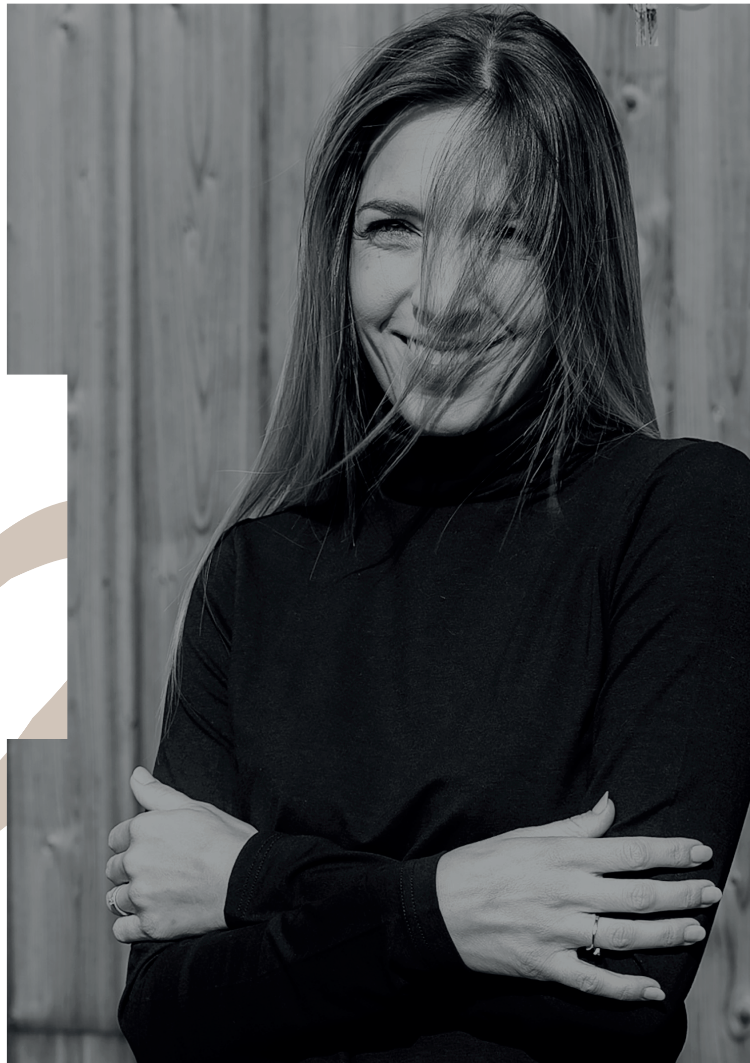
COD. 1611 TSHIRT COLLAR