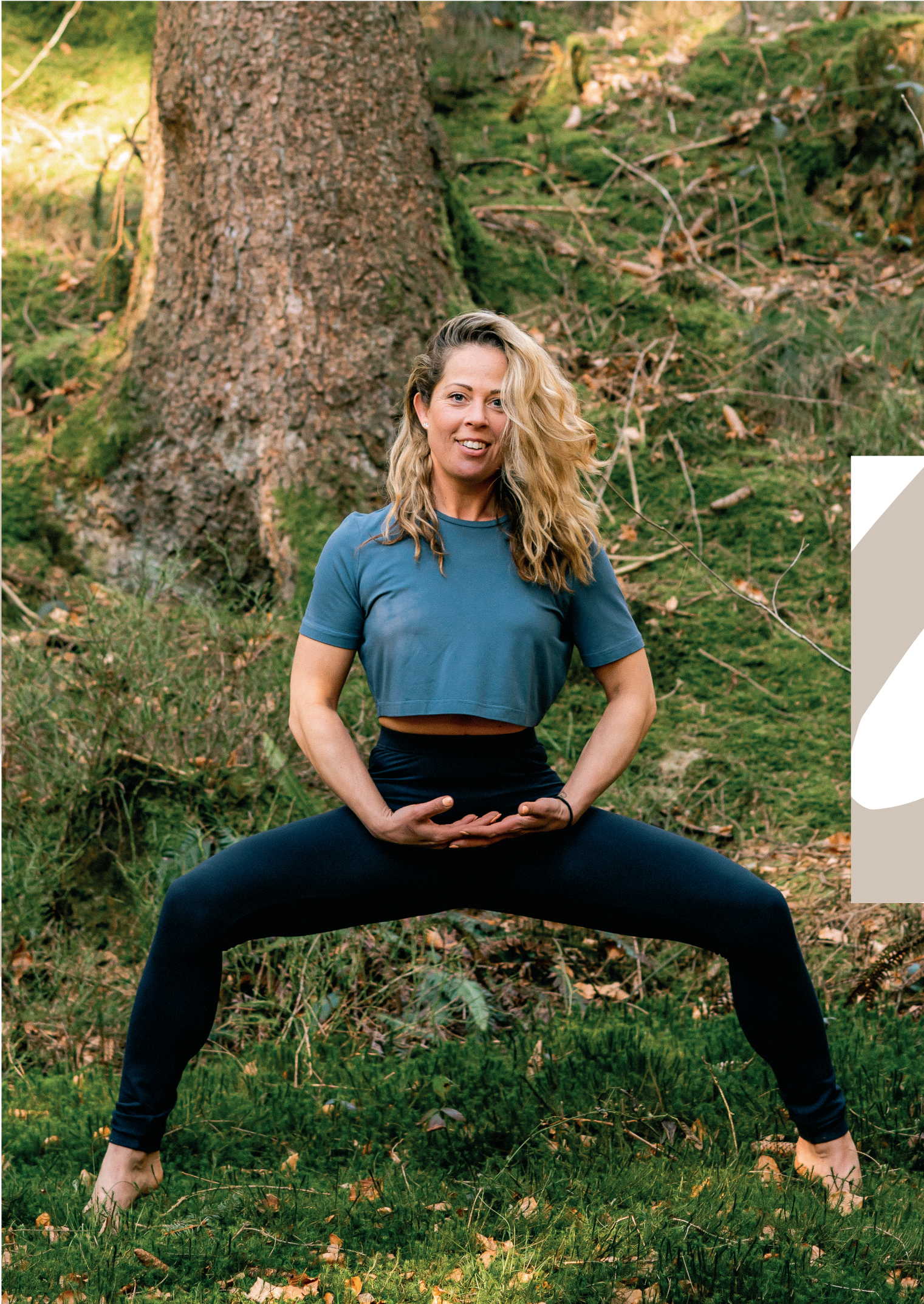
COD. 20043 T-SHIRT CROPPED MILA & JULES

COD. 20099 TOP SUN ALINE FABRIC JERSEY COLOUR GROUP C SIZE XS - XL PRICE €21 PRP €57 DESCRIPTION LENGTH 60 CM