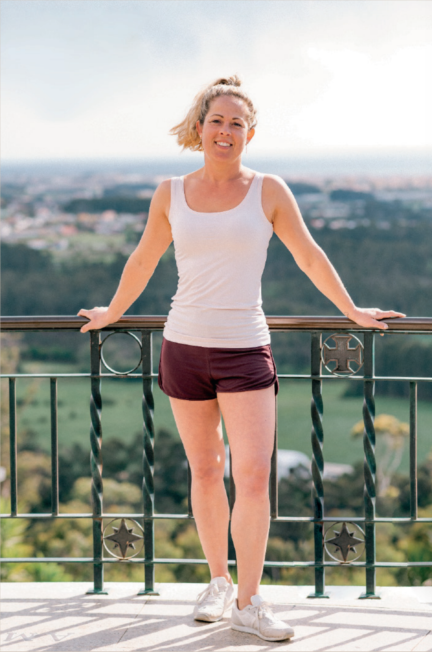
COD. 21133 SHORTS ROUND HEM