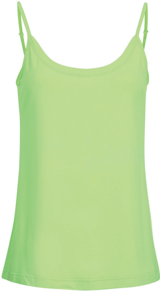
COD. 1303 TOP CLASSIC TIGHT FIT FABRIC JERSEY COLOUR GROUP C SIZE XS - XL PRICE €17.5 PRP €45 DESCRIPTION LENGTH 60 CM