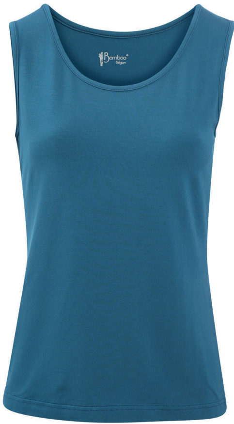
COD. 1306 TOP CLASSY TIGHT FIT FABRIC JERSEY COLOUR GROUP C SIZE XS - XL PRICE €17.5 PRP €45 DESCRIPTION LENGTH 60 CM